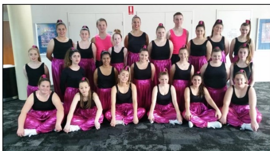
A very successful Southern Stars show at the WEC with our talented students performing along with other Illawarra schools