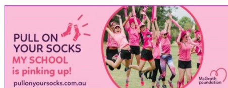
Café-ish and fundraiser on Friday to raise funds for the McGrath Foundation